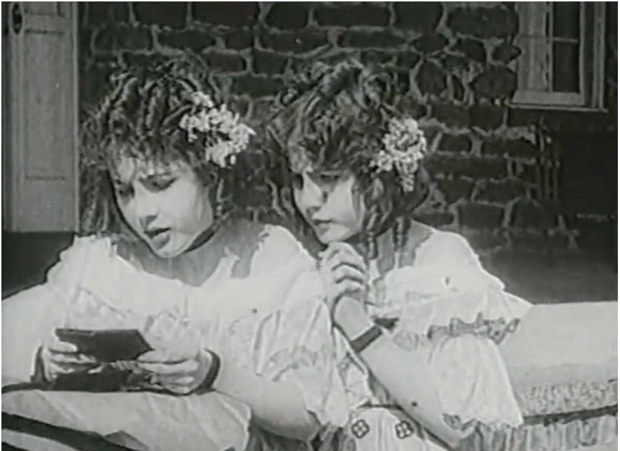
Figures 2 and 3. Cinematic sisterhood mise-en-abîme in Their One Love (Thanhouser, 1915).