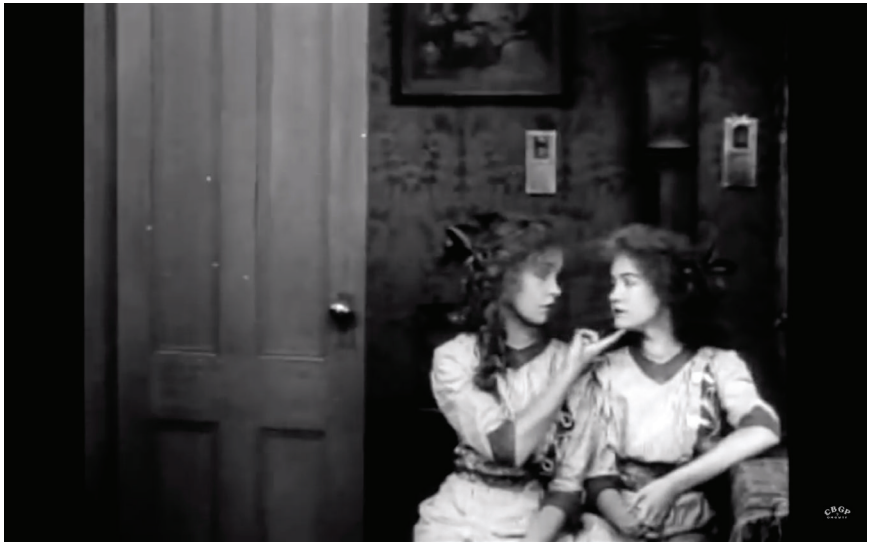
Figure 5. Lillian and Dorothy Gish performing ornamental sisterhood in An Unseen Enemy (Biograph, 1912).