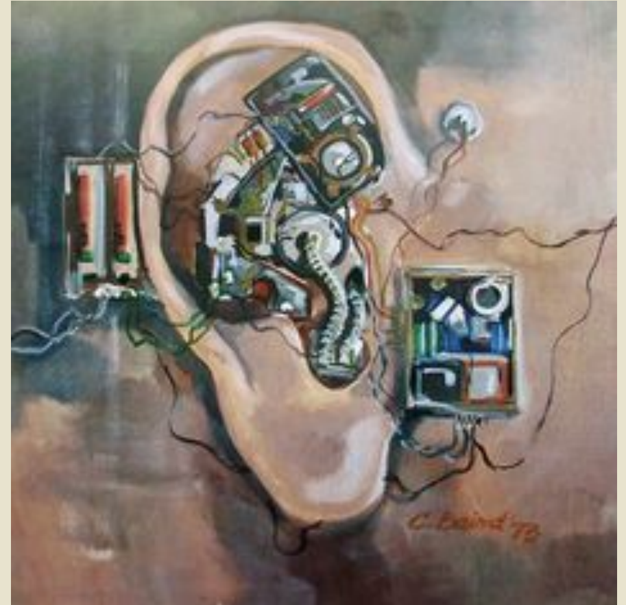
Chuck Baird Country: USA