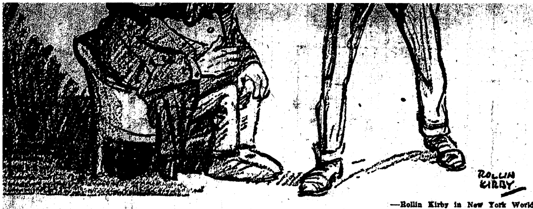
—Rollin Kirby in New York World.

as on revictualment has not yet dual institutions and national as have played a part. No re- tive come from the commissions central Europe. The food con- are not yet accurately known. has been sent into these coun- cannot be sent until the inter- committee meets and decides.